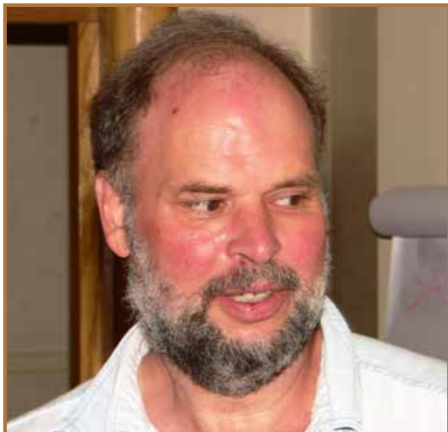
"Vaughan Jones p1190550". Licensed under CC BY-SA 3.0 via Wikimedia Commons - https://commons.wikimedia.org/wiki/File:Vaughan_Jones_p1190550.jpg#/media/File:Vaughan_Jones_p1190550.jpg