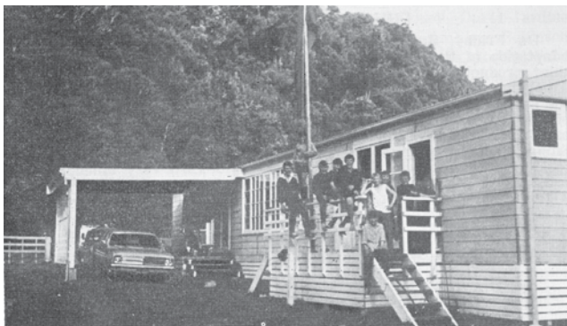
The Urewera and the outdoors – 'The Palace of the Park'

Editor's Comment. Many generations of St Peter's pupils have since made a trip into the Urewera national Park so will relate to this first visit!