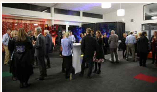
Alumni gathering at School before School Production 2014